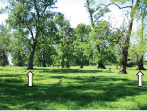
Fig. 2. Typical example of a cluster of scattered, mature Nothofagus obliqua trees in an agricultural landscape near Osorno, Chile. Arrows indicate nest trees used by Slender-billed Parakeets.

nesting habitat). Nesting habitat was defined as the area within a radius of 50 m around nest trees.