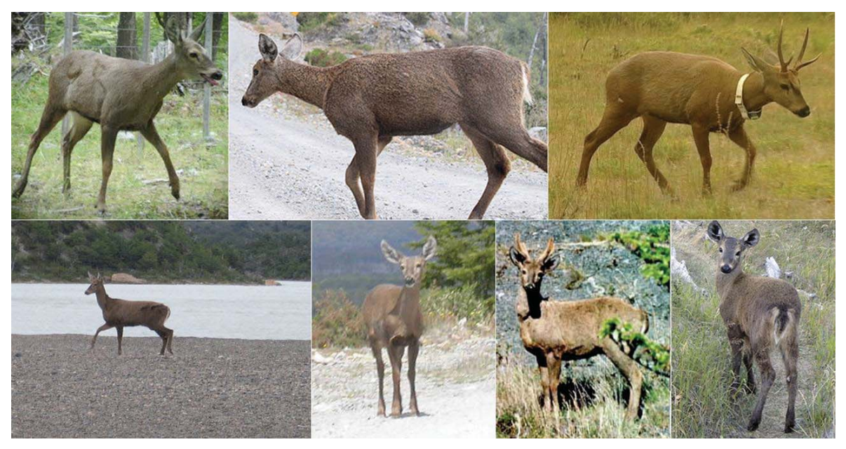
Image 2. Body shapes of several extant Huemul that are not in an alert stance and with summer coat.

During glacial periods, the Andes were covered with ice even to near the equator, and a continuous sheet covered the mountains from 33–56°S during the last glacial maximum. Glaciers south of 42°S dipped into the Pacific, overlaid the Andes 1600–1800 m thick, and reached hundreds of kilometers into eastern Patagonian plains where only treeless habitat existed, with Patagonia-like grasslands reaching way into Brazil, and much of South America covered by savannah and grasslands. Moreover, the sea level was about 120m lower and the Atlantic coastline located 300km or more to the east of the present coastline in some latitudes, which greatly extended the flat paleosteppe region eastwards (e.g., Marshall 1988; Clapperton 1993; Markgraf & Kenny 1997).